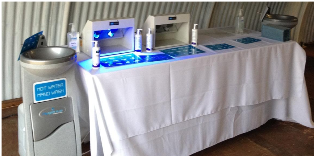
Example set up of hand washing activity

Best set up near sinks or can be done in bowls where water supply not available. Plug in UV light boxes. Set out UV gel, soap, good hand washing card guides and hand sanitiser.